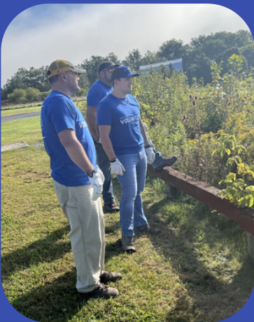
Howard Energy working on projects for Endless Mountain Mission Center