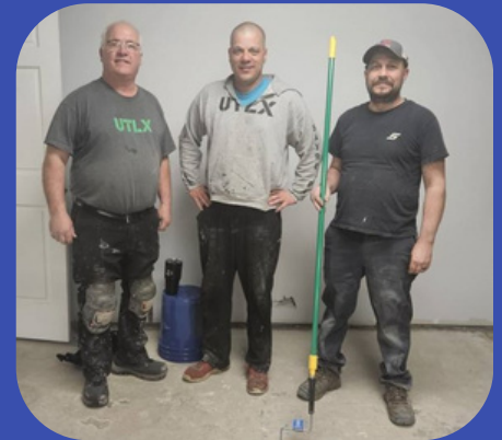
The Team from UTC Transco paint floors at The Salvation Army in Sayre