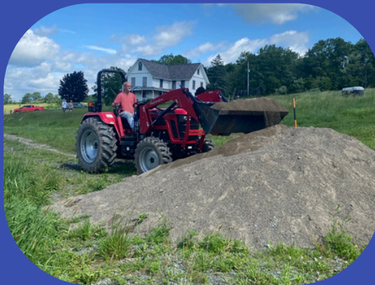
Volunteers help Urban Ark Conservation place gravel for his chicken coop