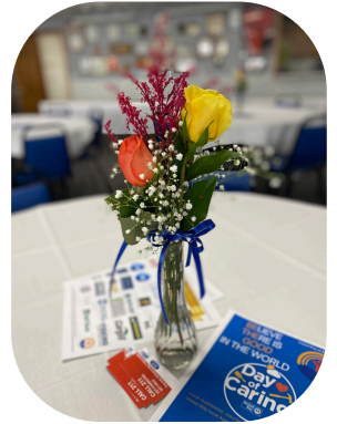
Thank you Valley Flower Shoppe for your centerpiece donations

Pledge to Win prizes were awarded to the many employees of our workplace partners who donated $52 or more to the campaign.