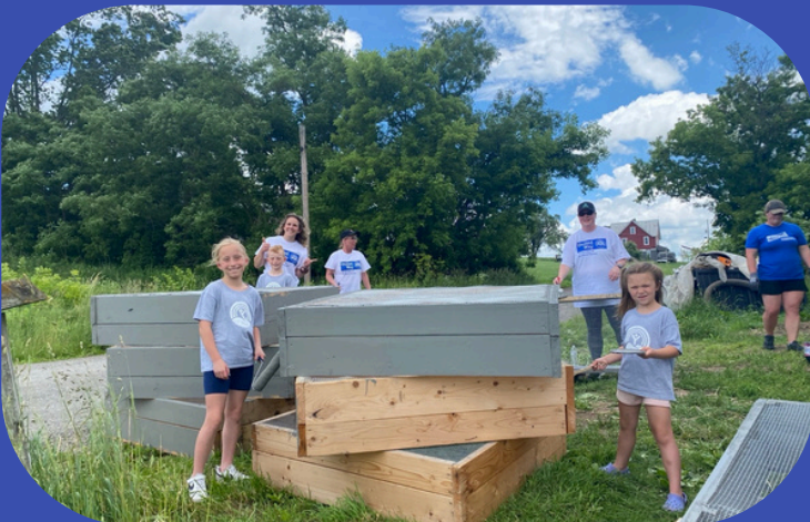
Volunteers paint garden boxes and mow for Urban Ark Conservation