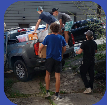
Towanda Football Players help UWBC with moving boxes